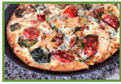
Although we offer gluten-free options, our kitchen is NOT a gluten-free environmen