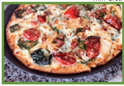
Although we offer gluten-free options, our kitchen is NOT a gluten-free environmen